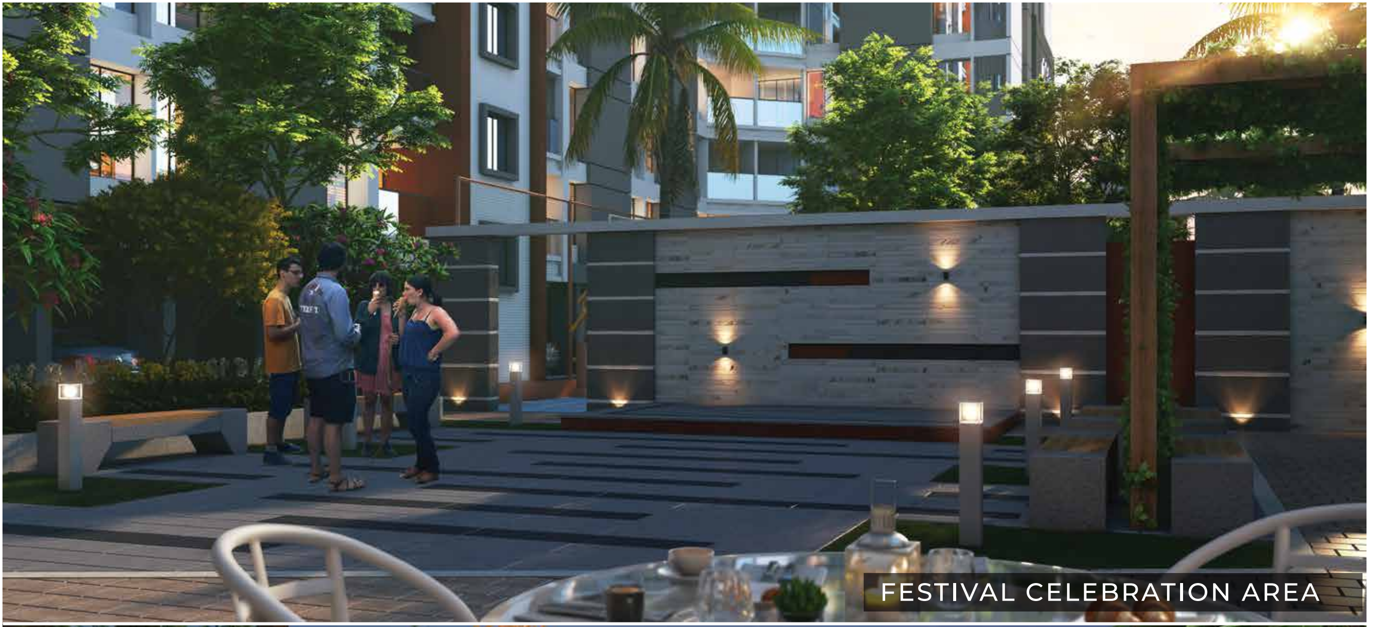
FESTIVAL CELEBRATION AREA